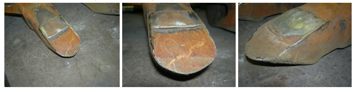
Fig. 5. Change of the anchor wear

After restoration and hardening, the nature of the wear process changes (Fig. 5). The wear rate of the front part is reduced, while ensuring the implementation of the "self-sharpening" effect. This leads to a decrease in the resistivity of the working body.