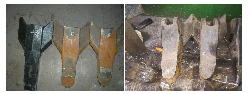
Fig. 7. View of worn anchors after the second and third restoration

However, the feasibility of recovery is lost when weight wear is 28-32 % of the weight of the new anchor. This is due to the wear not of the front surface of cutting and crumbling, but to the loss of