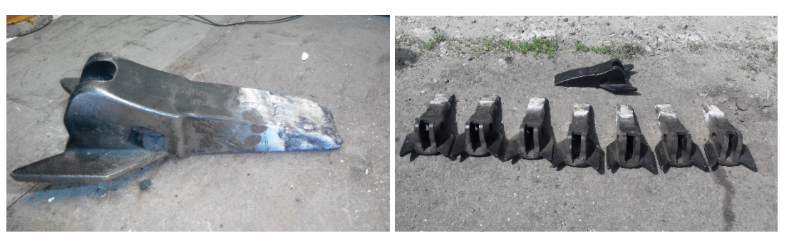
Fig. 4. Anchor after the first restoration and complete set of anchors

After restoration and hardening, the nature of the wear process changes (Fig. 5). The wear rate of the front part is reduced, while ensuring the implementation of the "self-sharpening" effect. This leads to a decrease in the resistivity of the working body.