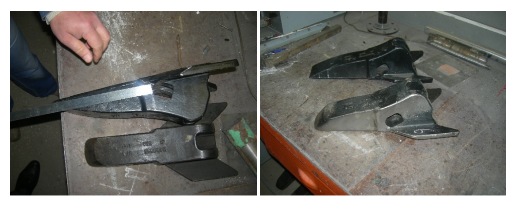
Fig. 2. View of the new and worn-out anchor

The main technological parameter for surfacing is the current strength. Experimental studies have shown that in the range of 90-120 A, recommended by the manufacturer of the surfacing material, a current of 110 A is optimal. In this case, the part does not overheat and the spray loss (lack of penetration) is minimal (Table 1). The choice was made according to the heating temperature and the output of the surfacing material (mass of wire before surfacing / mass of metal deposited on the part * 100 % = loss of material in %).