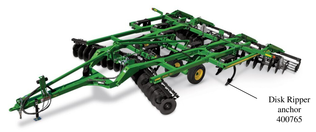
Fig.1. John Deere 512 Disk Ripper with anchor arrangement

The Ripper 512 design provides increased reliability by providing a high level of maintainability. This is manifested in the replacement of a quick-wear element-the anchor (tip), and not the entire rack. It is supplied by the dealer as spare part with high added value. However, their resource is not increased, and manufacturers do not provide measures to improve wear resistance. The resource is provided by the structural material-high-strength cast iron, from which the tip is made by casting. A number of studies have been conducted to assess the possibility of carrying out renovation activities.