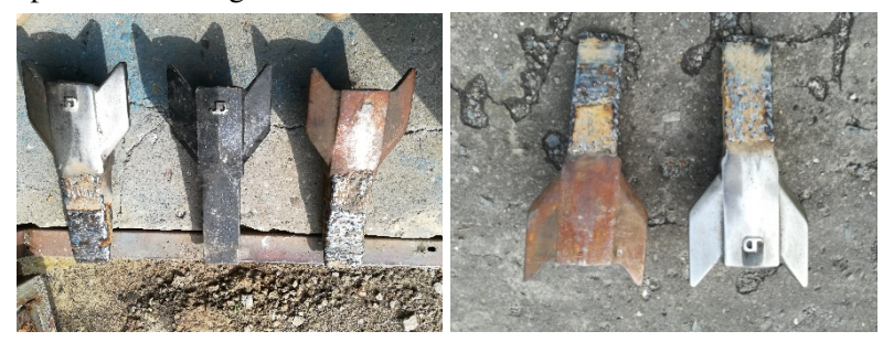
Fig. 6. View of the anchor after the second and third restoration

During the development of the technological process, the possibility of re-restoration of the anchor surface was checked. The difference between the technological process for the second and third surface restoration is the amount of the applied surfacing material. At the third restoration, it is 3-5 % more (Fig.6). It was found that the cutting surface of the anchor after the third restoration wears out 1.15 times slower than the anchor after the second restoration (Fig. 7). This is due to metallurgical processes during repeated surfacing.