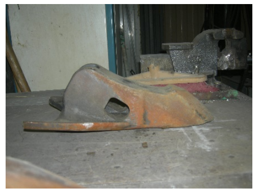
Fig. 8. View of the extremely worn-out anchor that cannot be restored

mass of the side surfaces of the anchor and its "wings". The remains of a previously restored and strengthened surface are seen in Fig. 8. In this case, the loosening process is completely disrupted.